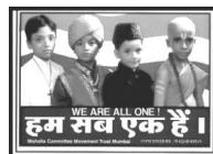
Naata - The Bond India, 2003. 45' Dir: KP Jayashankar and A Monteiro

The film investigates the Godhra train burning and subsequent rioting that killed 3,500 Muslims in Gujarat, India in Feb 2002. In trying to analyze what actually led to the events, it retraces the route of the first batch of karsevaks from Gujarat to Ayodhya (where Hindu fundamentalists want to build a Ram temple) and back and the terror they unleashed en-route.