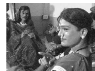
The Unconscious India, 2003. 19' Dir: Manisha Dwivedi

Skin Deep is an exploration of body images and self perception among contemporary urban, middle class women in India. It is a playful, engrossing and articulate film on the complicated and contradictory relationships women have with their bodies.