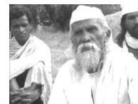
The Fire Within (Buru Sengal) India, 2002. 57' Dir - Shriprakash

Naata is about two friends who work on conflict resolution and communal harmony initiatives between the different communities in Dharavi, reputedly, the largest "slum" in Asia. Naata also looks critically at the popular perception in India of Dharavi as a "slum", making it thus, a film about Indian society as well.