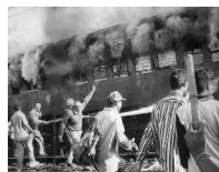
Godhra Tak India, 2003. 60' Dir: Shubradeep Chakravorty

This film is a journey with men who call themselves "kothi". They are men for their families and society, but for themselves they are women, and wives of other "macho" men. They walk two tightropes, both of fear and disgrace of and for their families and "husbands". And yet, they celebrate womanhood in their world of disguises.