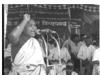
Development Flows from the Barrel of the Gun India, 2003. 54' Dir: B Toppo & Meghnath

The land of the Tana Bhagats, a peaceful sect of the Oraon tribe who follow a Gandhian lifestyle and philosophy, is today besieged by Naxalite violence. In tracing the impact of the underground Maoist guerillas, the film touches upon corruption, the mafia, energy politics and displacement of villages, and tribal identity in an area where coal has been mined for the last 150 years.