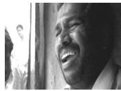
A Night of Prophecy India, 2002. 77' Dir: Amar Kanwar

A rural artist paints her autobiography, images of Bollywood movie icons are erased after a week-long run of their films, the national flag flutters on 150 kites, installation artists paint pop icons on the rolling shutters of shops. Symbols of nationalism become a fashionable commodity. Made in India is about contemporary visual cultures in India.